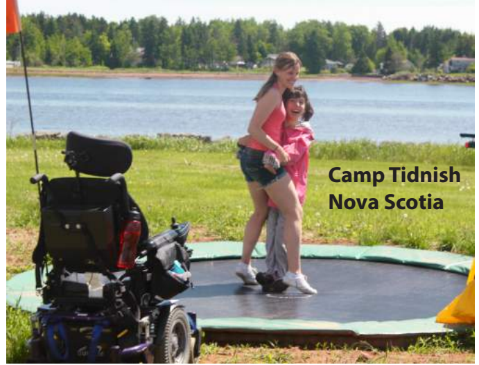
Camp Tidnish Nova Scotia