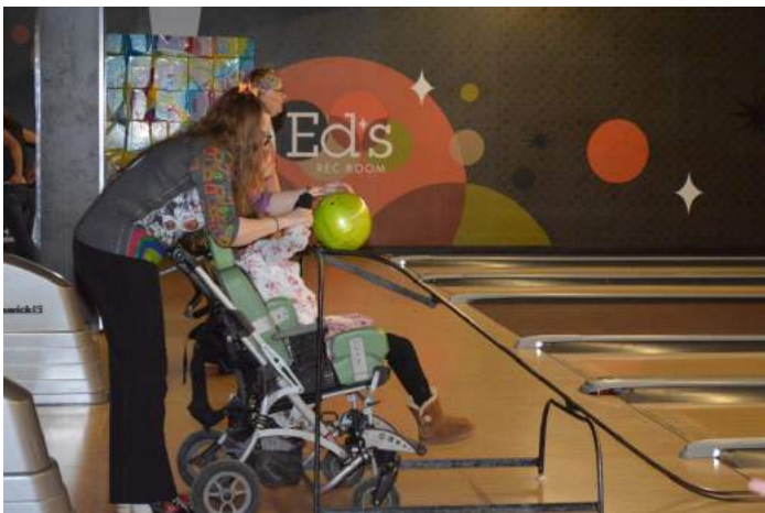
Edmonton Bowling Challenge - February 26, 2015