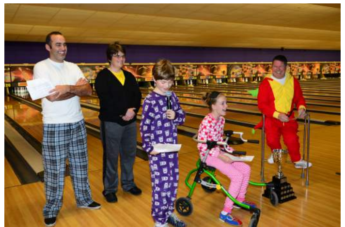
Toronto Bowling Challenge - November 26, 2015