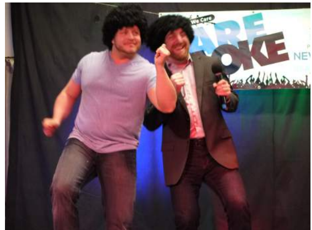
We Care-aoke - March 25, 2015