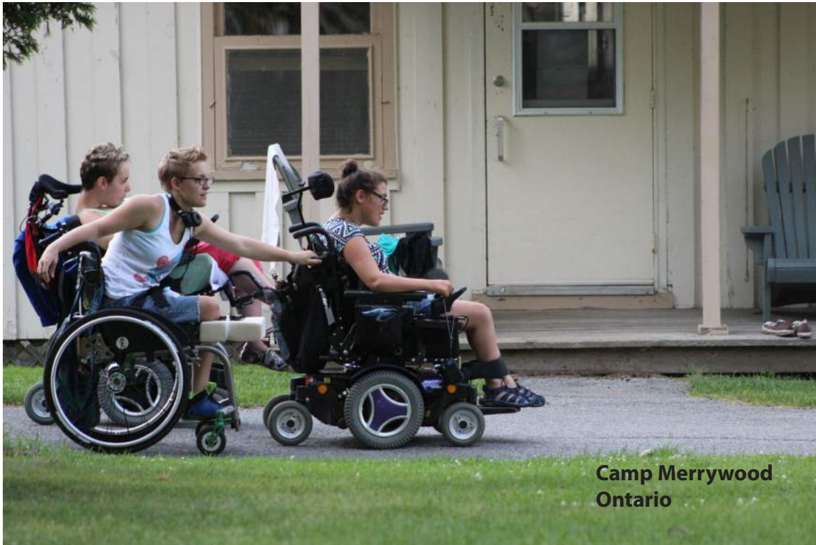
Camp Merrywood Ontario