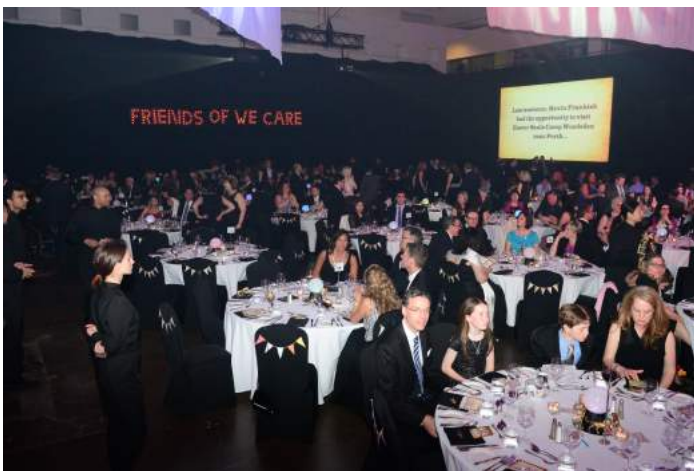
We Care Gala Dinner & Awards - May 2, 2015