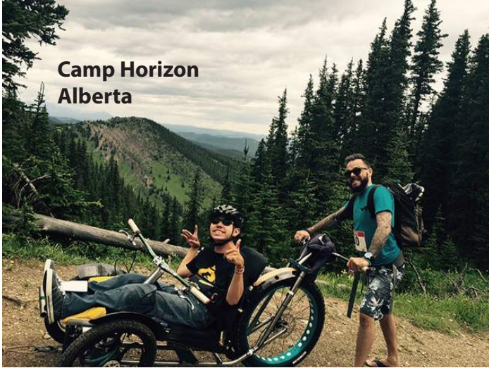
Camp Horizon Alberta