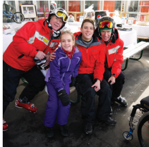
We Care/LCBO Ski Day - January 30, 2015