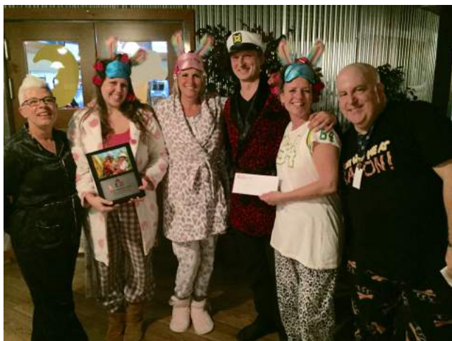
BC Bowling Challenge - November 19, 2015