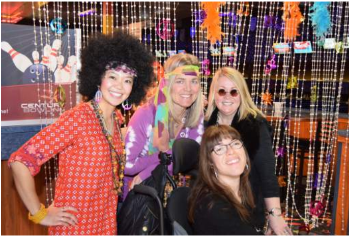
Calgary Bowling Challenge - January 29, 2015

These exciting events held throughout the year help to create awareness and raise funds to send kids with disabilities to summer camp.