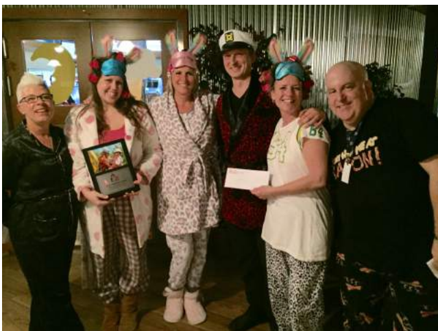
BC Bowling Challenge - November 19, 2015