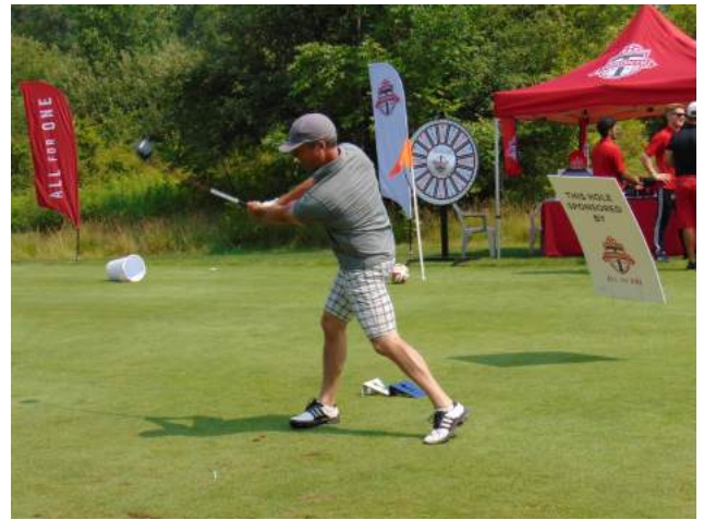
Labatt Charity Golf Classic - July 6, 2015