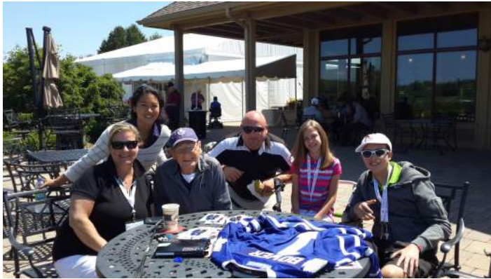
Golfing with the Pro's Charity Golf Classic - June 24, 2015