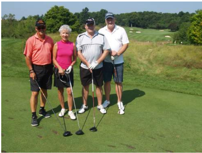
Devil's Pulpit Golf Event - August 17, 2015