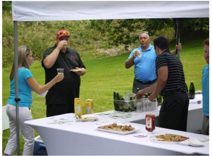
La Classique d'automne de les Amis de nous aidons - September 14, 2015