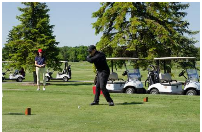
We Care Golf Classic with LCBO - June 2, 2015