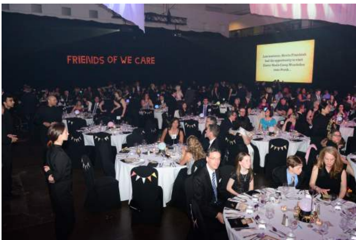
We Care Gala Dinner & Awards - May 2, 2015